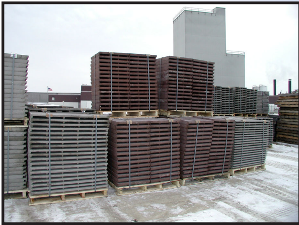
Covers can be Colored.

Chart depicts our most common sizes, other sizes available. Covers are Pedestrian rated 200 lbs./ft 2 .