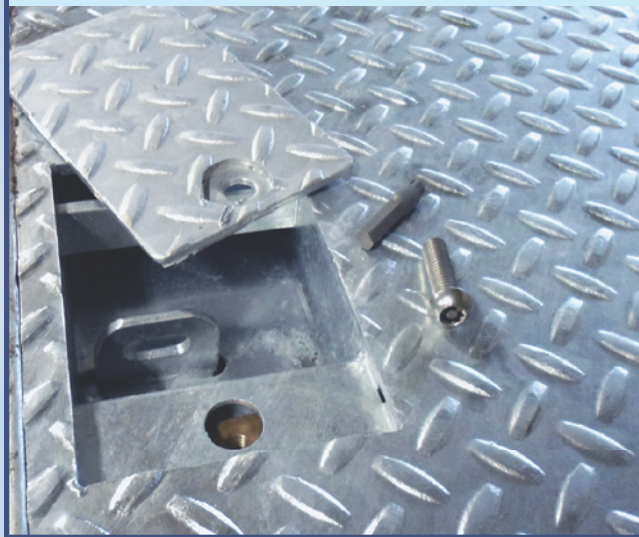
CLOSE-UP OF PADLOCK AREA WITH THE ACCESS COVER REMOVED

www.concastinc.com/hand_holes/Traffic_Rated_SureLock/